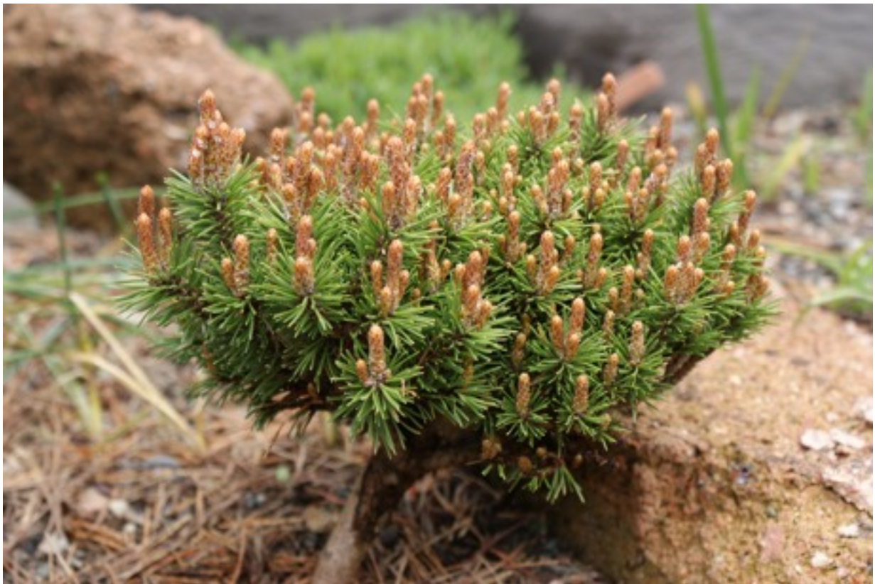
Pinus mugo var. pumilio 'VanDusen's Mini'