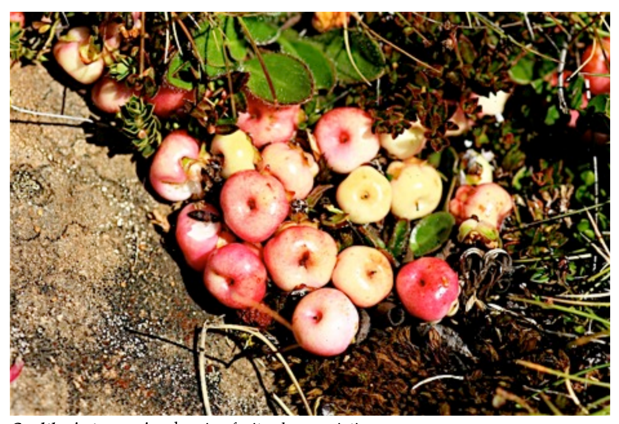
Gaultheria tasmanica showing fruit colour variations

Gaultheria tasmanica was known until recently as Pernettya tasmanica. This is one of my favourite plants and grows easily in an acid soil in a well-lit position. It is completely prostrate, forming a tight mat with 6mm deep green, elliptic leaves. The typical, white bell-shaped flowers are followed in Autumn with 10mm fruits which are generally red but can also be white, pink or yellow (See picture below). The fruit is comprised of a fleshy inflated sepal and calyx. The berries in the red form resemble clusters of bright red apples and is the main reason that many growers want to establish this plant in their rock gardens. It is commonly found on the central plateau at an altitude of 1000m. This area is generally rather rocky and barren in most places with little or no tree cover. Temperatures here can get very low with frosts of minus 10 degrees with frequent snow falls. When it makes its way into damp areas, it will colonize mounds of Abrotanella forsterioides, with the fruits nesting against the dense foliage. I have grown this plant for many years and found it prefers a sunny position, as it does in its native habitat.