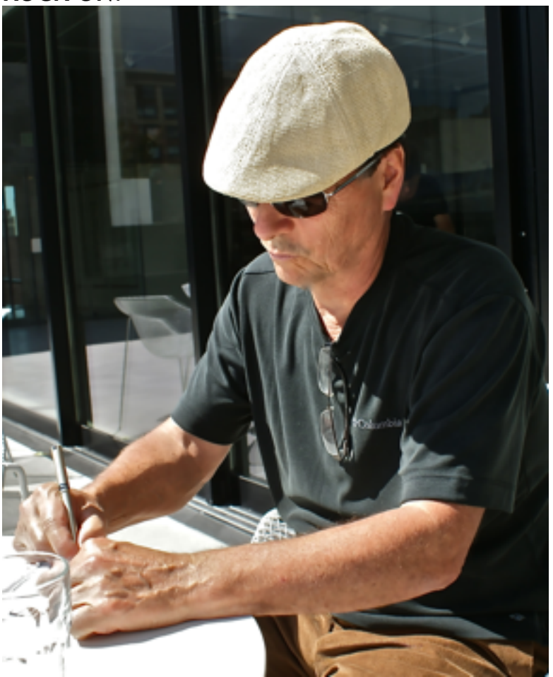
Editor at work- longhand still works but penmanship deteriorating!

I'm sure that everyone in the alpine club that gardens here on the coast must be shaking their heads in disbelief at the amazing California Spring that we're having. Everything is early and strong with the possible exception of those plants that really need a good vernalization like tulips. The Narcissus, however, especially the doubles and split corolla types, have been outstanding. (More on Narcissus in the next Bulletin.)