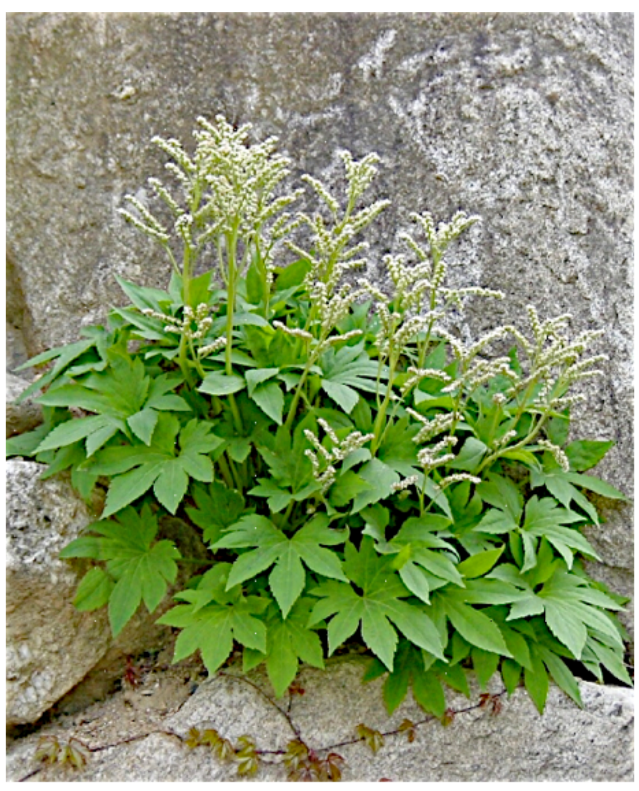
Mukdenia rossii growing in situ in limestone rock crevices near Mukden, the sacred city of the Qing dynasty. It is a tough Saxifrage relative that needs a little light and good drainage to succeed. A few good cultivars are available that are more compact than the type and thus wonderfully suited to the woodland or rock garden.