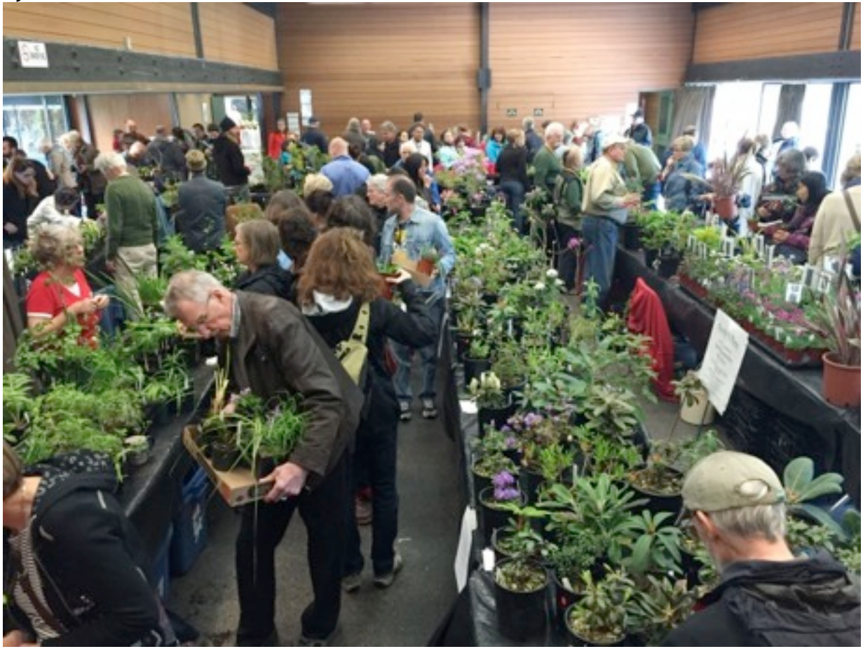
2015 AGCBC Spring plant sale was well attended