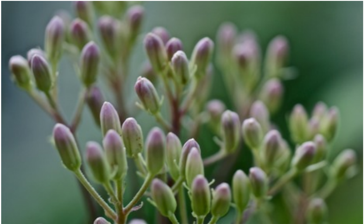
Close-up of the flower clusters before flowering. Simply lovely.

This protracted state of floral expectancy is simply wonderful on a daily basis. Okay...I admit, that when they flowered for the first time, I was just a little crestfallen. Maybe Tantric love isn't all its cracked up to be. However, upon a closer look the following season, I came to love their flowers. And, no, I am not talking about the aberrations of macrophotography that can make anything that is bizarre seem beautiful. The naked eye will do just fine. But those frosted pink nibs?- well they are something else! Yes, we all have our weaknesses. The stalks are sensational too as the photo below shows.