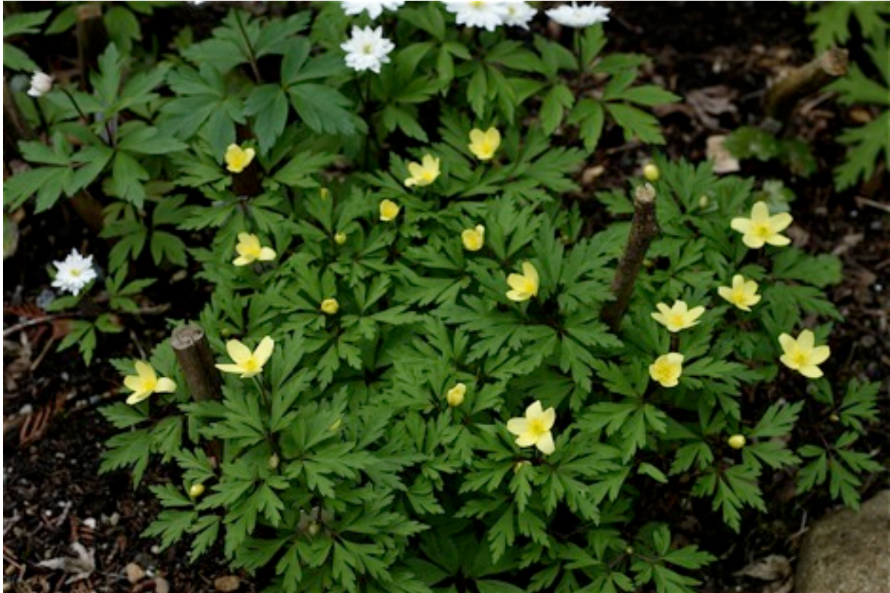
Anemone x lipsiensis with A. 'Blue Eyes' in the background

Anemone x lipsiensis is a good garden plant. The picture below shows the difference in foliage between it and A. 'Blue Eyes' . A. x lipsiensis is often offered as A. x seemenii or x seemanii (incorrect). It is an intermediate natural hybrid between A. nemerosa and A. ranunculoides . My plant takes after A. ranunculoides but has single flowers of a soft yellow and lovely, dissected foliage. It attains about 4" in height. It spreads very slowly. There is always a peak moment when the flowers are seemingly all out at the same time. It is a sweetheart.