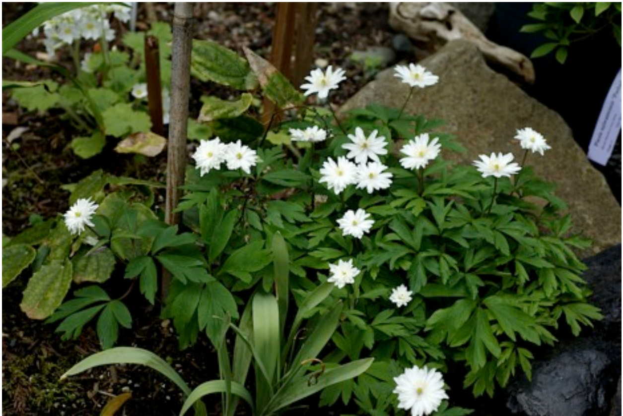
'Blue Eyes' early in the flowering cycle with no blue eyes

pick this one up at the VIRAGS Spring plant sale. For my money, the best cultivar is 'Blue Eyes'. It may not be as vigorous as some cultivars but in my mind that is a good thing given that it is a rhizomatous species. Be aware that it likes richer soil to do its best so it is not the best companion for those that like it leaner. It may take some time in the garden to really strut its stuff and be fully double. The other asterisk is that the blue eye develops as it ages or wanes in its flowering cycle. Rick Lupp of Mt. Tahoma Nursery south of Seattle, WA has a lovely selection of 'Blue Eyes' called 'Graham Grace' that I have found to be very good. As you might expect there are many nemerosa cultivars out there but keep your eyes peeled for the following: 'Green Dream'- even showier than 'Green Fingers'; 'Pink Delight'- sumptuous, double pink flowers; and, 'Blue Beauty' with strongly bronze-tinted leaves.