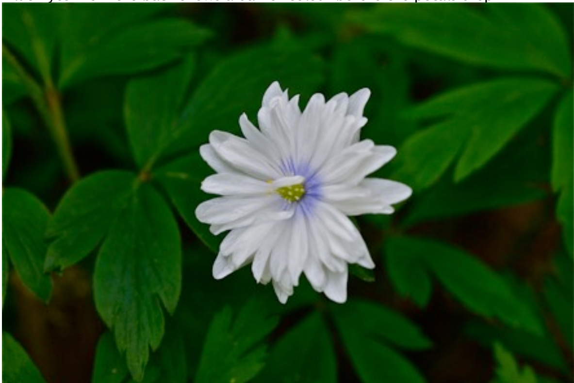
Anemone 'Blue Eyes' at its flowering peak