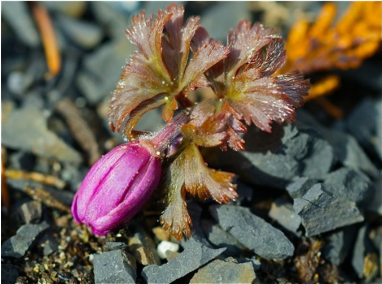
Anemone blanda 'Radar' just emerging and showing bronze foliage

Anemone has long been a staple of gardens. Writing in 1629, John Parkinson was effusive that Anemone is " of itself alone almost sufficient to furnish a garden with their flowers for almost halfe the year. " (Paradis). He was likely referring to the wood anemone or A. nemerosa . Consumers of trendy plants are often dismissive of these trusty types. The smaller ones which are ideal for the rock garden shouldn't be penalized for their ease of culture or their showiness, should they? These stalwart members of the Ranunculaceae family are a diverse genus with about 120 species. Some Anemone are tuberous whilst others are fibrous rooted. Generally, they are creatures of the high forest and their edges ranging from montane to rocky subalpine and higher preferring some relief from the afternoon sun. Many of the montane species