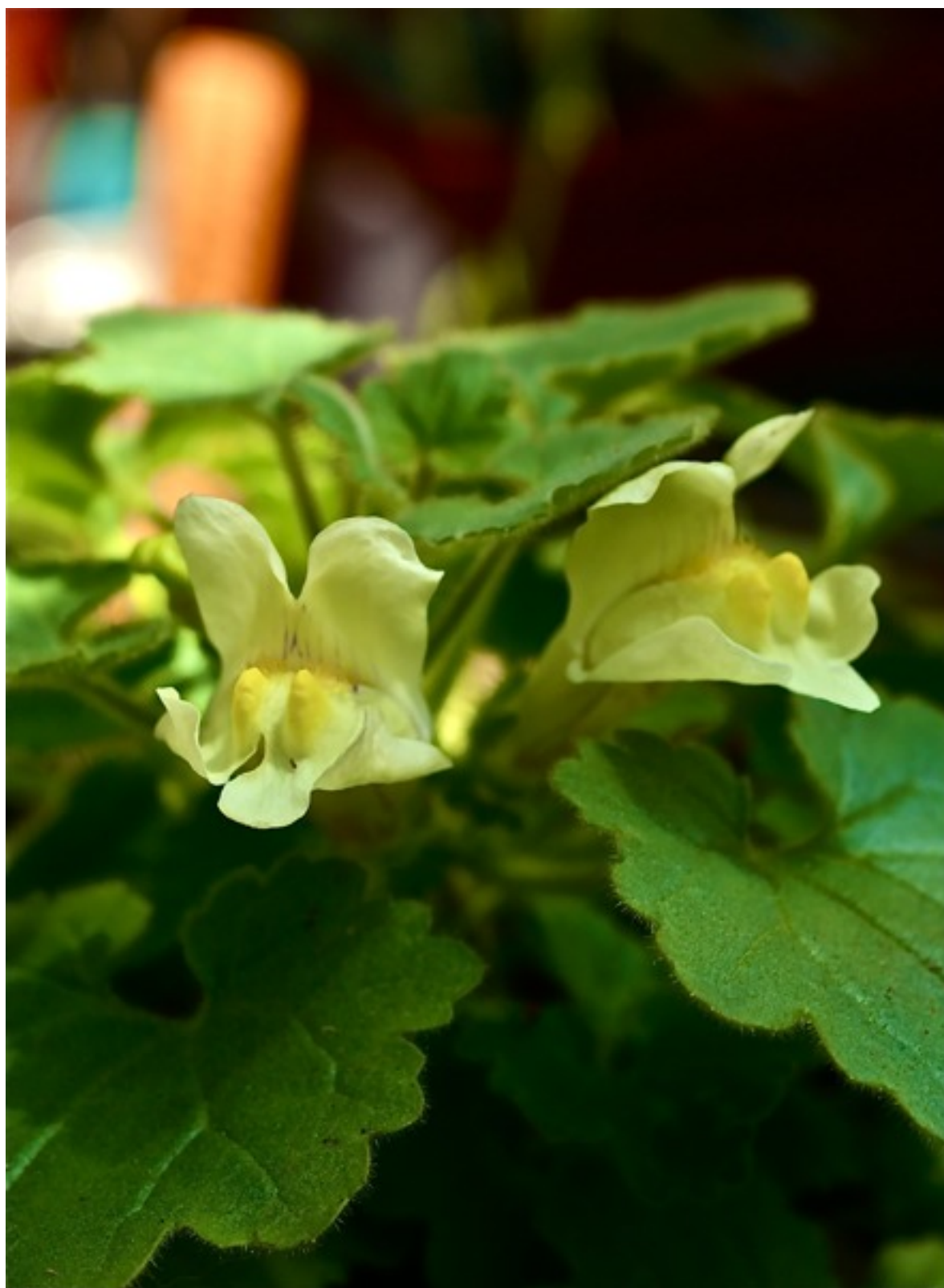
Asarina procumbens compact form