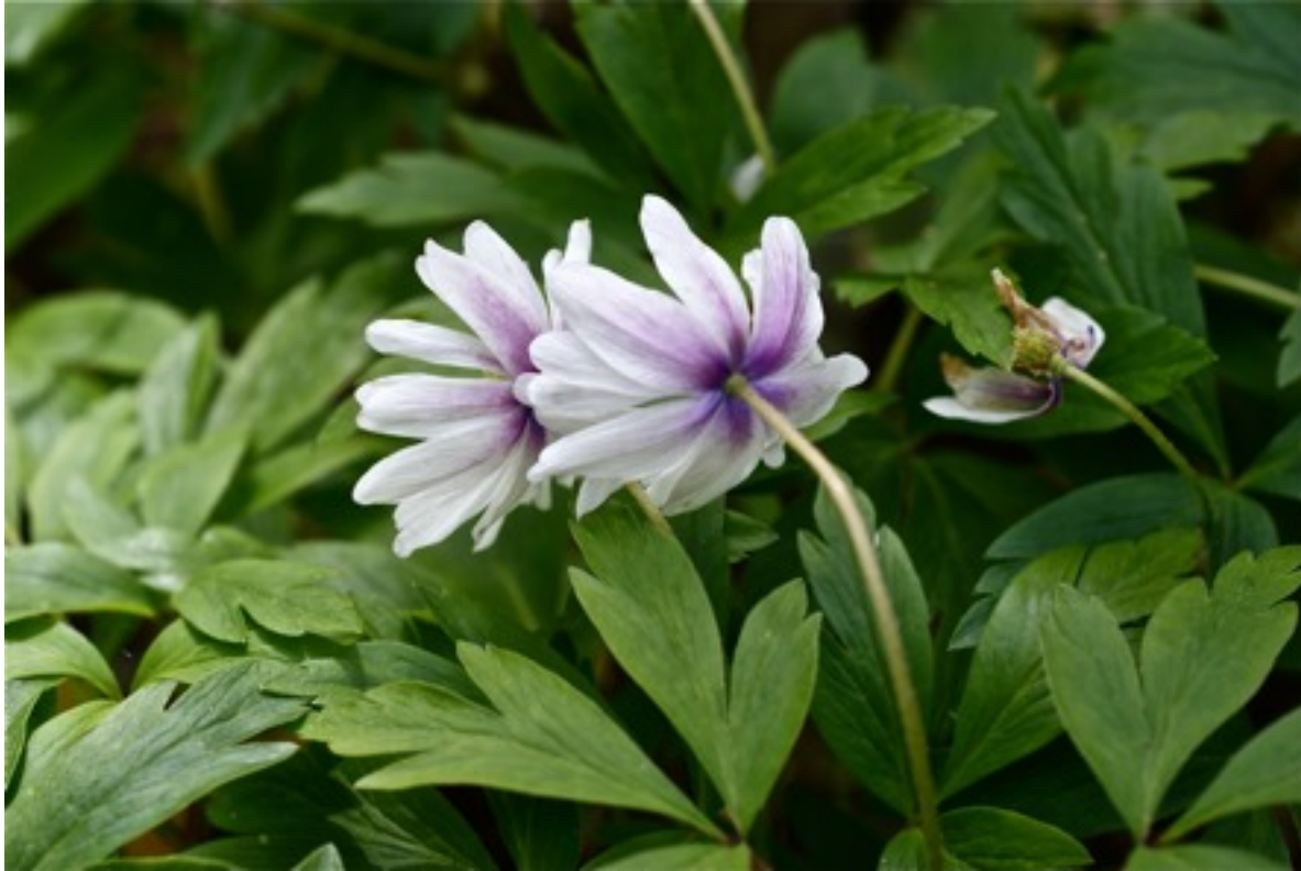
'Blue Eyes' from the back shows a darker colour before the petals drop