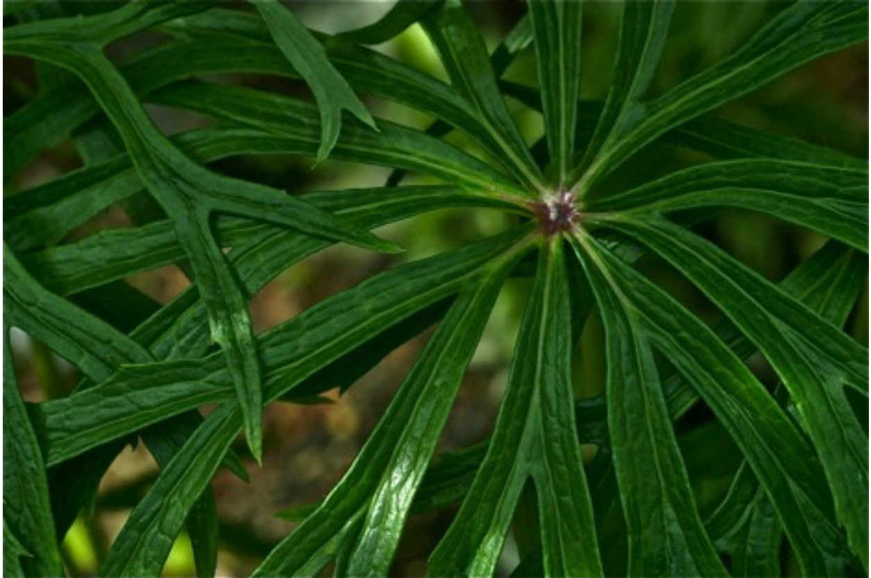
The subcoriaceous leaves after the arachnoid-tomentose phase

The gorgeous leaves are staged on a platform about 2' off the ground and provide another springboard for strong, striated purple stems that rise up another 3'. Finally, on top of these stems are perched elegant clusters (corymbs) of frosted pink nibs that look so delicate yet are so strong. At this stage, in mid-Spring, the leaves are fully out and their leaves have a thick, almost coriaceous quality. All those emergent, tomentose cilia are compressed now and provide an excellent energy generator for the plant.