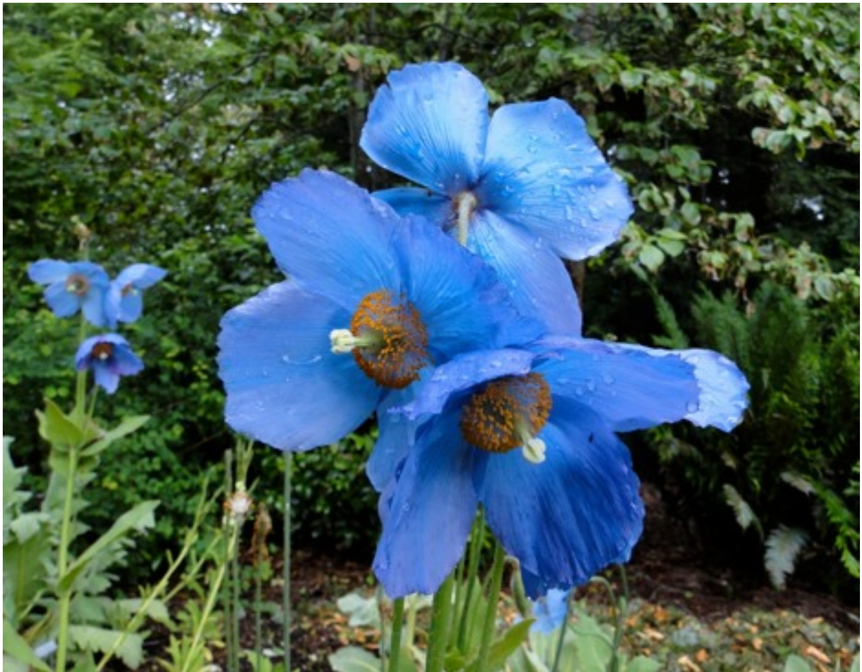
Meconopsis 'Lingholm' in Bill Terry's garden

This book is a great follow-up to Bill's previous book Blue Heaven: Encounter with the Blue Poppy (Touchwood Editions, 2009). That book covered propagation of the many Meconopsis species. For the Meconopsis enthusiast, Terry's latest book provides critical, first-hand information on their growing conditions and ecology in nature, such as aspect and geology. This is valuable information for those wishing to grow these successfully as Bill surely does. Hopefully, all of us who read this book will improve their success rate as well.✿