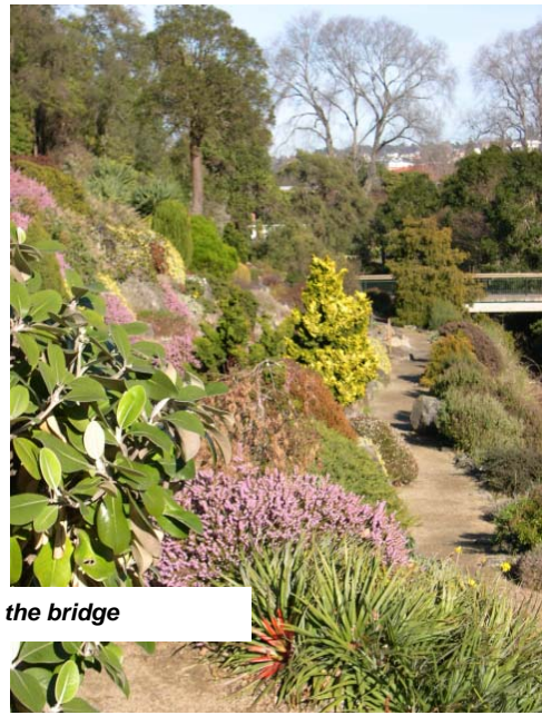
Rock Garden with Pachystegia insignis