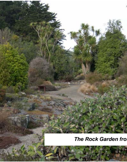
The Rock Garden from the bridge

oped on the steep slope rising above the creek and being 175m long and only 15m wide it disappears off into the distance. The slope faces