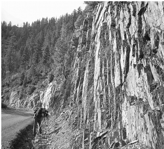
Richie Steffan photographing cliff plants