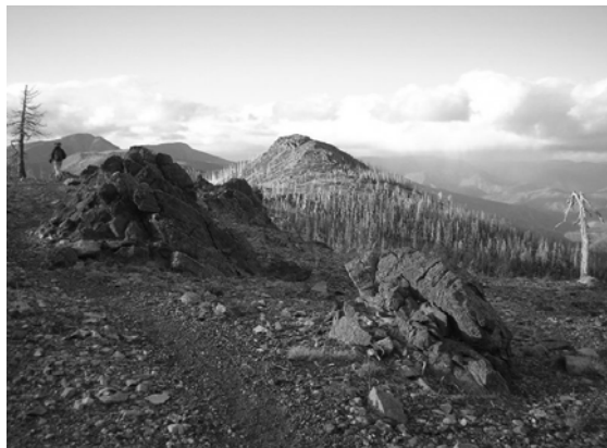
Approaching Whetstone Butte

perennial, shrub and tree species. In my case, I managed to make about 40 of these over the next three days. I will highlight some of them and illuminate various scenes which, while they are still fresh in my mind, delighted me during the stay.