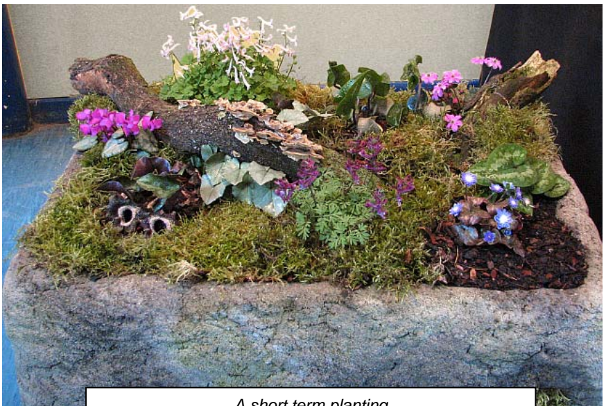
A short term planting