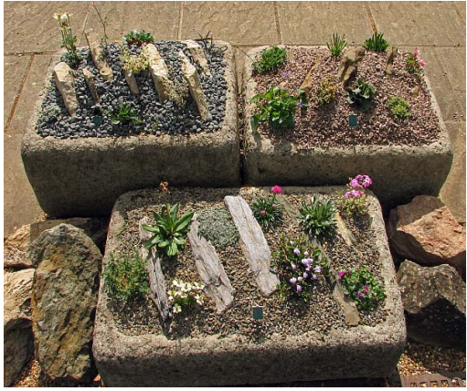
Below: Examples of troughs