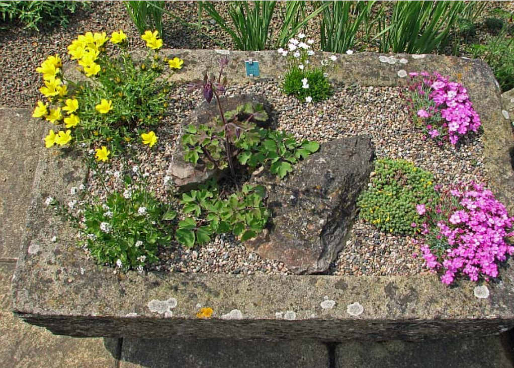
Above: A May flowering trough Below: Pleione formosana 'Clare'