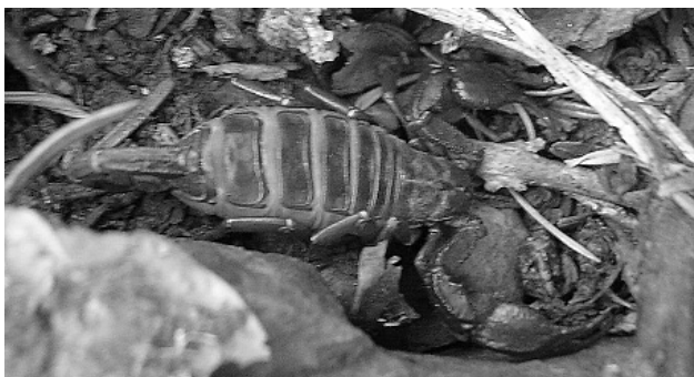
An unexpected find! Scorpion on Thompson ridge