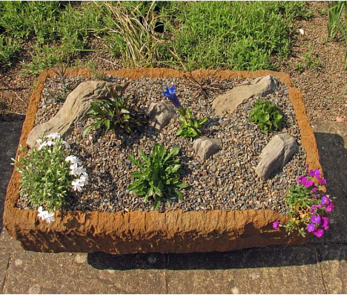
Above: A resin trough