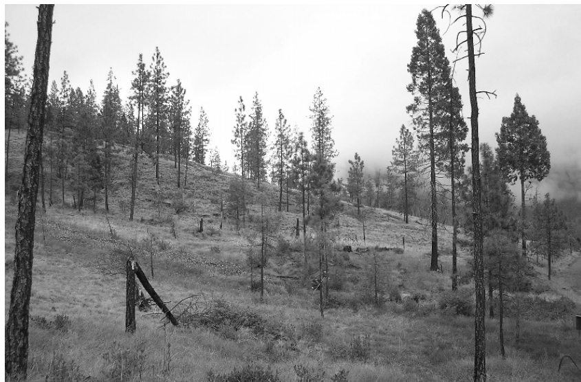
Days Gulch, Darlingtonia ribbon

By the following morning the weather had abruptly turned. Skies were their leaden northwest worst and slanting rain began with force just as we threw our gear into the vehicle. Although we had made plentiful collections, they were not particularly alpine this time around.