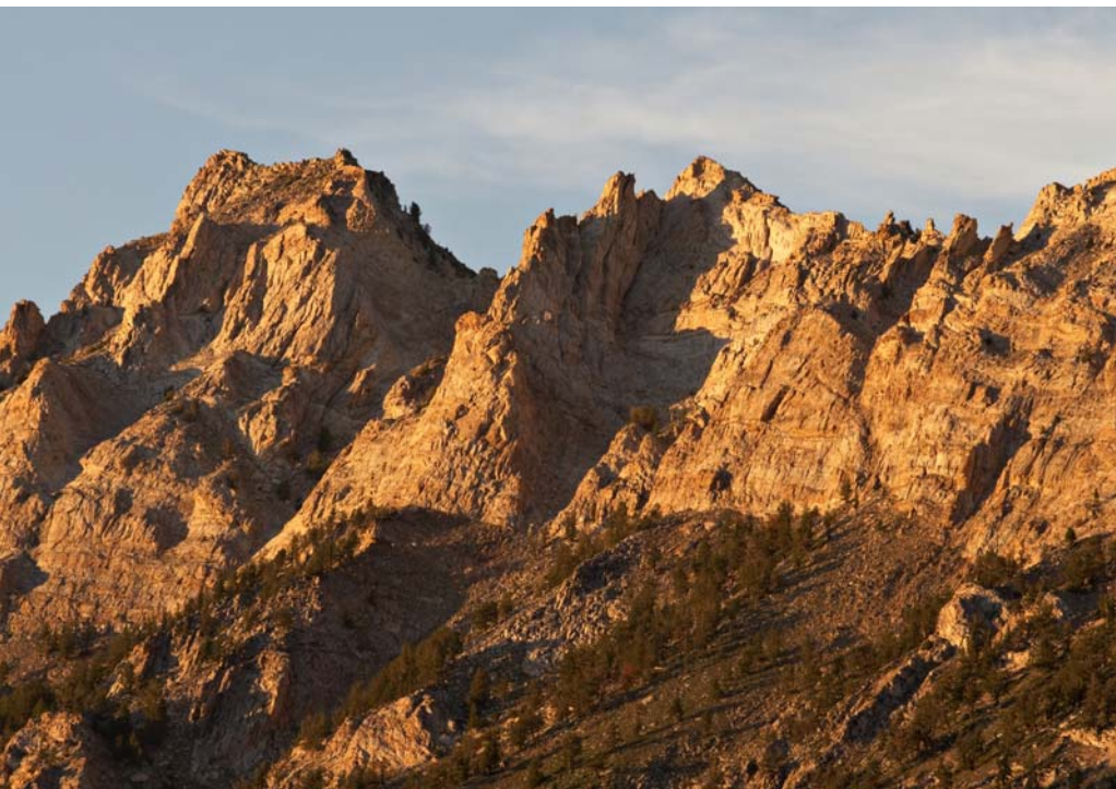
Above: Ruby Mountains in Evening Light