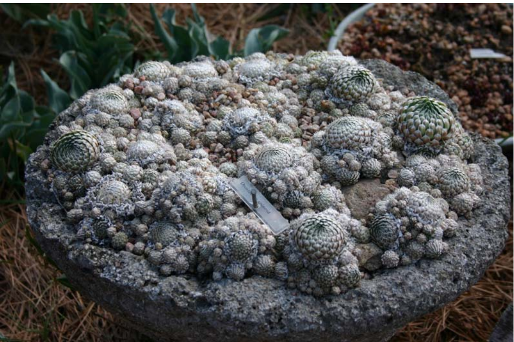
Above: Orostachys spinosa Below: Eritrichium howardii