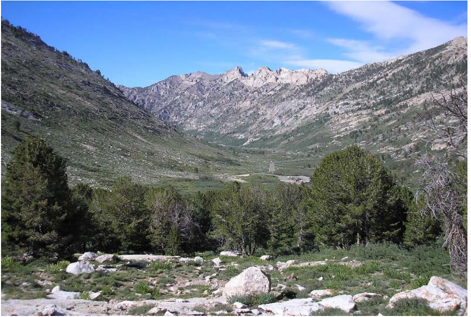
Intermountain Scenes & Plants: Lamoille Canyon, Ruby Mountains, Nevada