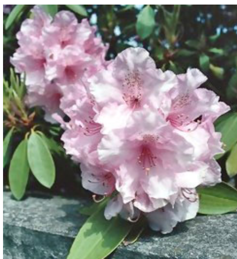
Rh. Maximum – state flower of W. Virginia

We stopped at several places strewn with very large, quite flat rocks, often very tippy to walk upon. Wandering over them was worth the effort for the cracks and crannies afforded great protection for plants. Kalmia was the dominant plant here in these open spaces but there were many other things of interest. I especially liked a Clematis occidentalis (formerly C. verticillaris ) with its attractive seed heads as it scrambled over the rocks. There was also a large patch of the Bleeding Heart Dicentra eximia .