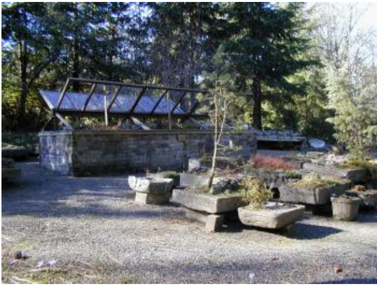
Regional natives and alpiners from around the world grow side by side in the trough garden