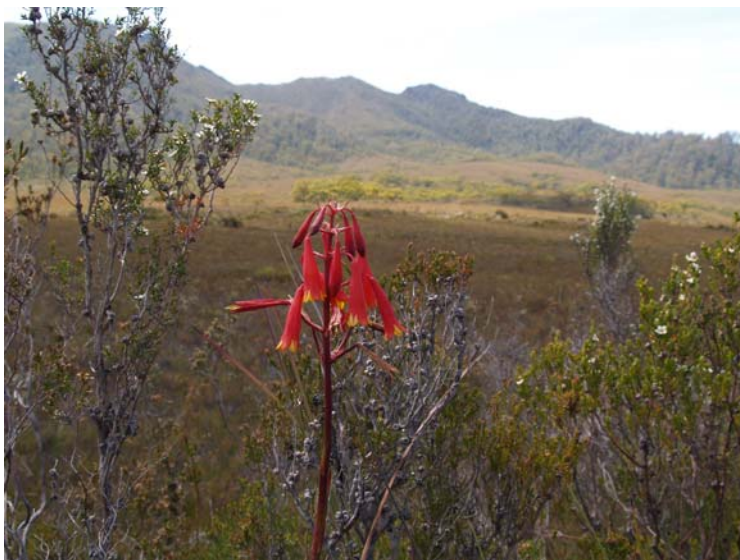
Blandfordia punicea , Tasmania