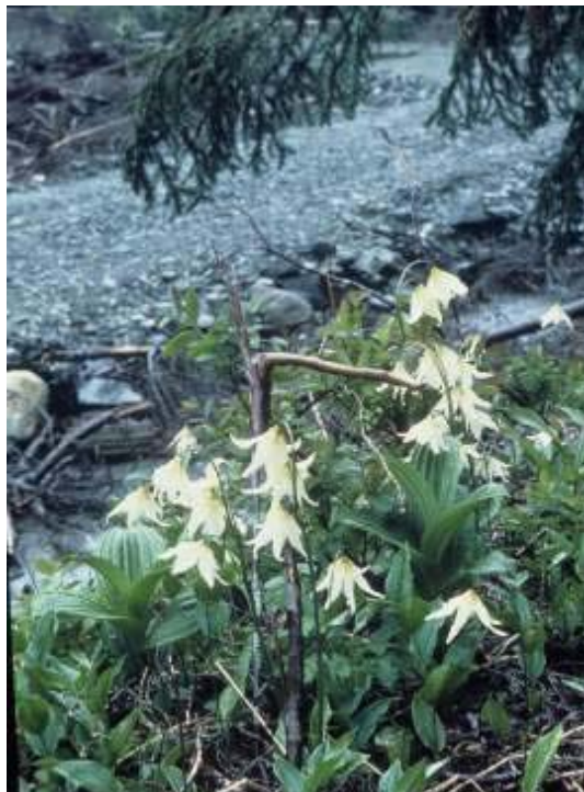
Erythronium montanum , San Juan Ridge

the same as the thousands in the mountain meadows, but they have the characteristics of the Erythronium on San Juan Ridge and Mt. Hebo. The reason is obvious: the Mt. Rainier plants in the photo are in scree-like conditions where there is no competing vegetation.