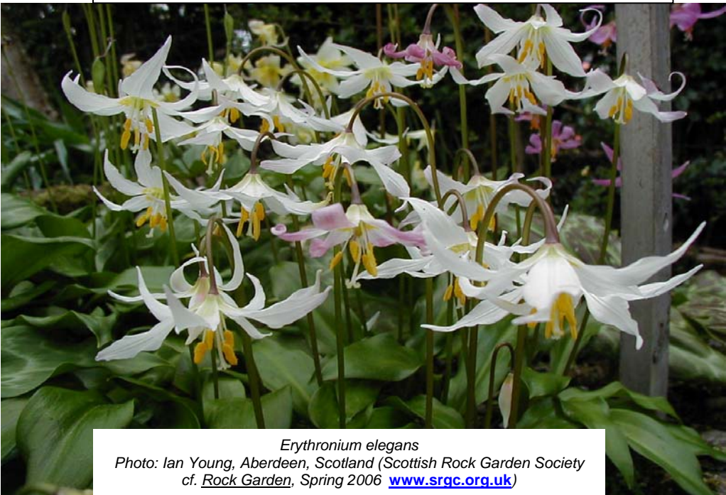
Erythronium elegans