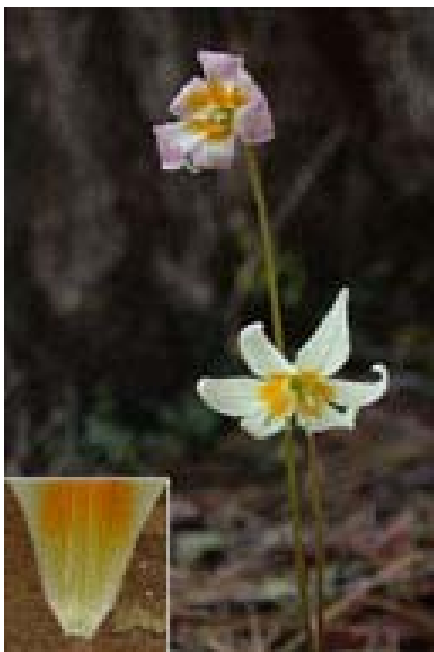
Erythronium howellii