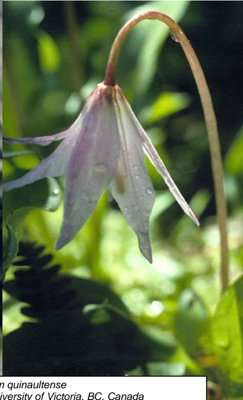
Erythronium quinaultense