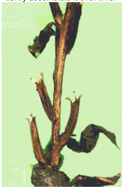
Oenothera : Ripe seedpods Oblong-shaped buds, formed on upper parts of main stems and branches, open in sequence up the stem to produce the 4- petalled yellow flowers; these open in the evening, each lasting only 1 or 2 days.

that matter), have single-seeded fruits that come loose from the plant as soon as ripe, and then may lie in the enclosing calyx for a while, but usually fall out immediately. These are very hard to collect - sometimes I put a piece of paper or plastic under the plant, but then you have to worry about the whole thing getting wet. I found that Salvia forskahlei makes enough seed so that you can shake it out on a piece of paper once a day and get enough. Mertensia (at least M. sibirica , which is the only one I can grow) is not so prolific, and some years I succeed in getting the seed, and other years I don't. This is where you run into one of the disadvantages of garden seed: usually there aren't all that many plants, so that you can't collect all you need in one go, you have to patiently accumulate it over time.