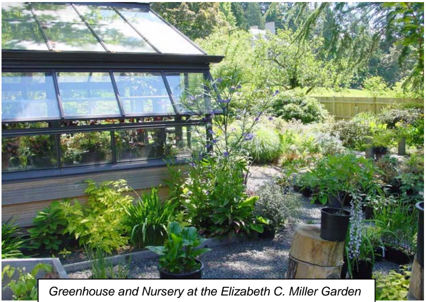
Greenhouse and Nursery at the Elizabeth C. Miller Garden

creases readily as does C. formosanum . The largest-flowered species, C. kentuckiense also grows and multiplies well.